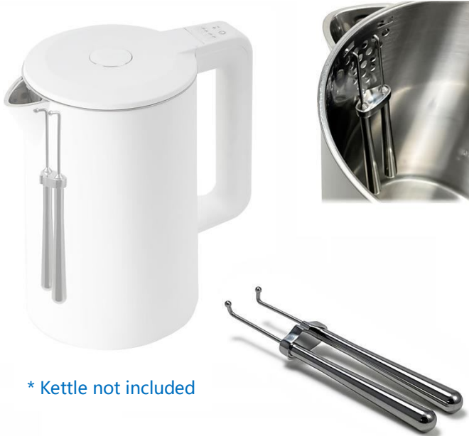
* Kettle not included

HKE KettleMate Hexagonal Water Generating Pendant is a hexagonal water generator specially designed for Kettle. The user only needs to put the pendant into the filter holes of the stainless steel kettle and boil it together with clean water. The boiled hot water becomes Hexagonal Water, also known as Structured Water, and in Europe, even called Revitalized Water.